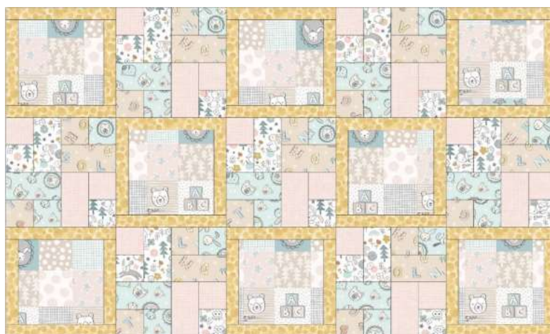
Lay out of the first three rows.