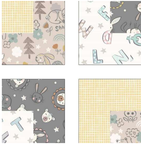
Block 2 made up of four parts

Use your favorite method from fabric 6 to bind the quilt.