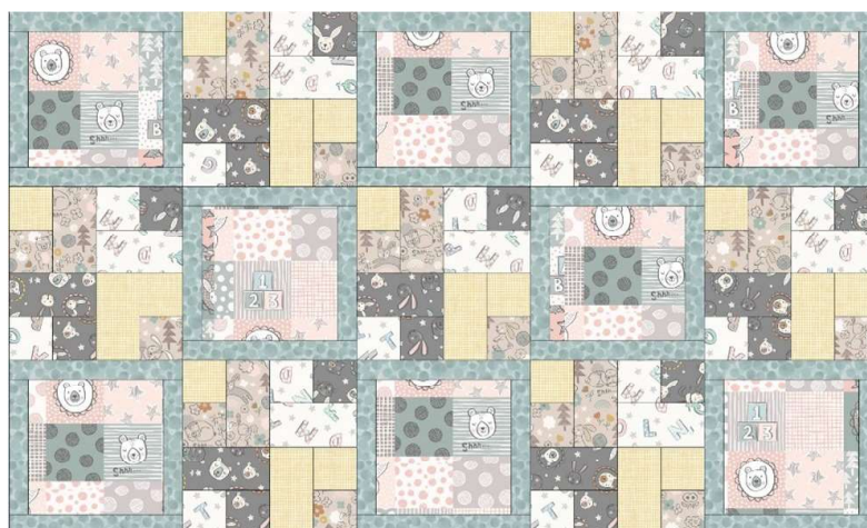
Lay out of the first three rows.