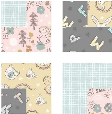
Block 2 made up of four parts

Use your favorite method from fabric 6 to bind the quilt.