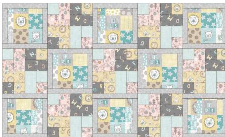
Lay out of the first three rows.