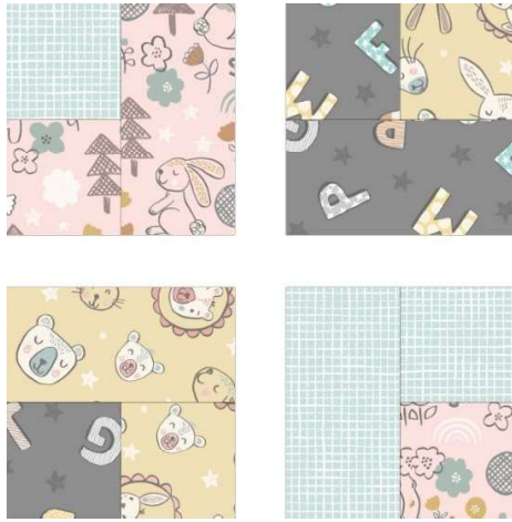
Block 2 made up of four parts

Use your favorite method from fabric 6 to bind the quilt.